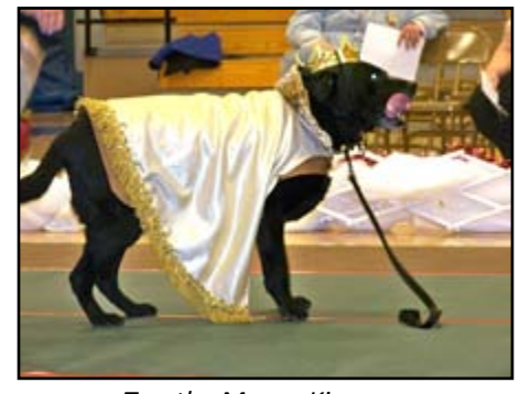
Tex, the Mouse King